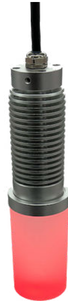
{Acrylic Cylinder Lit Red}

Another accessory available for the Spatial Mini is the Spatial Mini Cylinder. It's an 8cm frosted acrylic cylinder that screws onto the end of the Spatial Mini.