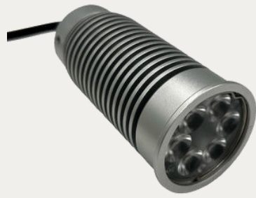
SKU: SpatialMini-RGBWW SpatialMini-WW